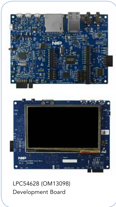
LPC54628 (OM13098) Development Board

The LPC546xx MCU family is architected to be power efficient for applications that require data aggregation from several different inputs. This MCU family provides a variety of wake-up sources including the FlexComm peripherals. Once the MCU becomes active, application use cases are endless with 10 FlexComm interfaces for sensors and HMI, options for cloud connectivity, and a graphics display to interact with the information.