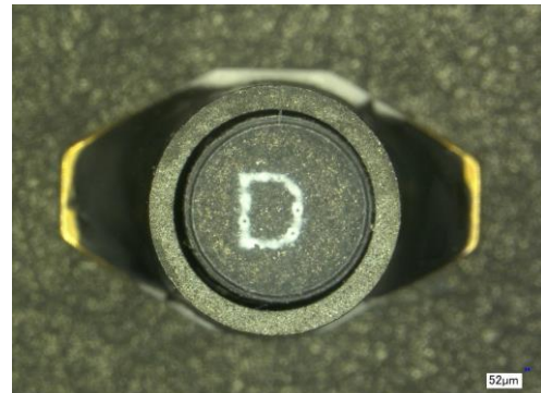
Marking with Pad-Printing